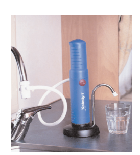
"Plus" add-on kit for connecting to taps at home, in a boat, in a caravan, etc.

Integrated bottle adapter - fits directly on top of most bottles