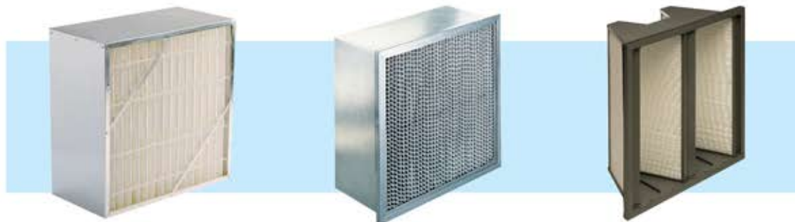
Multi-Flo Synthetic and Microfiberglass Extended Surface Rigid Filters

In addition to the Multi-Sak, Koch offers a wide range of other high efficiency air filters to meet the requirements of any air filtration system.