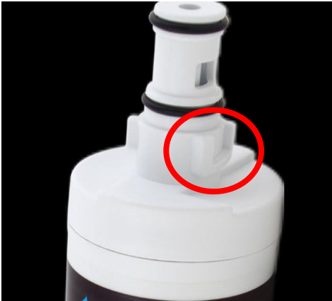
Locking mechanism of the old filter

If the locking mechanism of the old filter is as shown, follow the steps below: